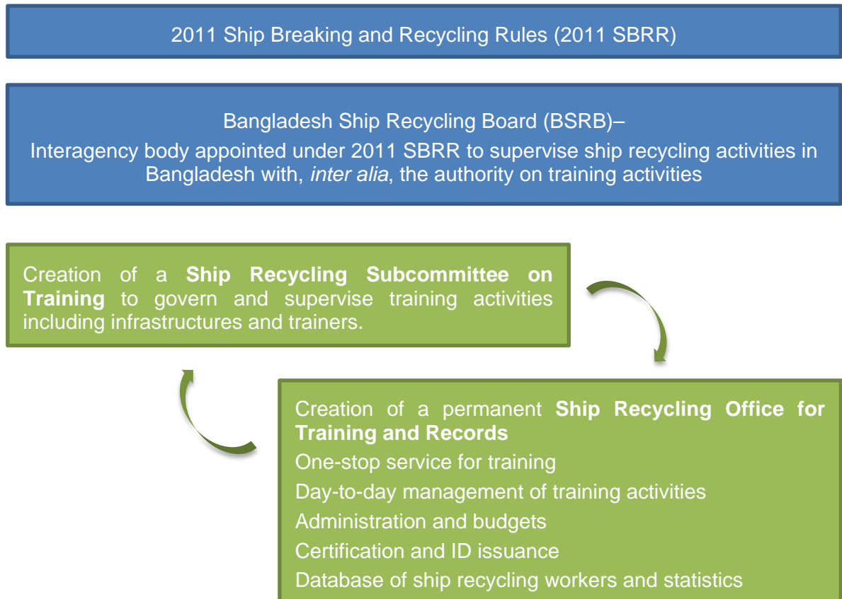
Figure 1: Management and Administration Hierarchy